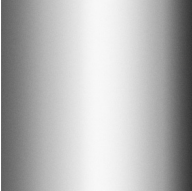
Brushed Gold - BGD